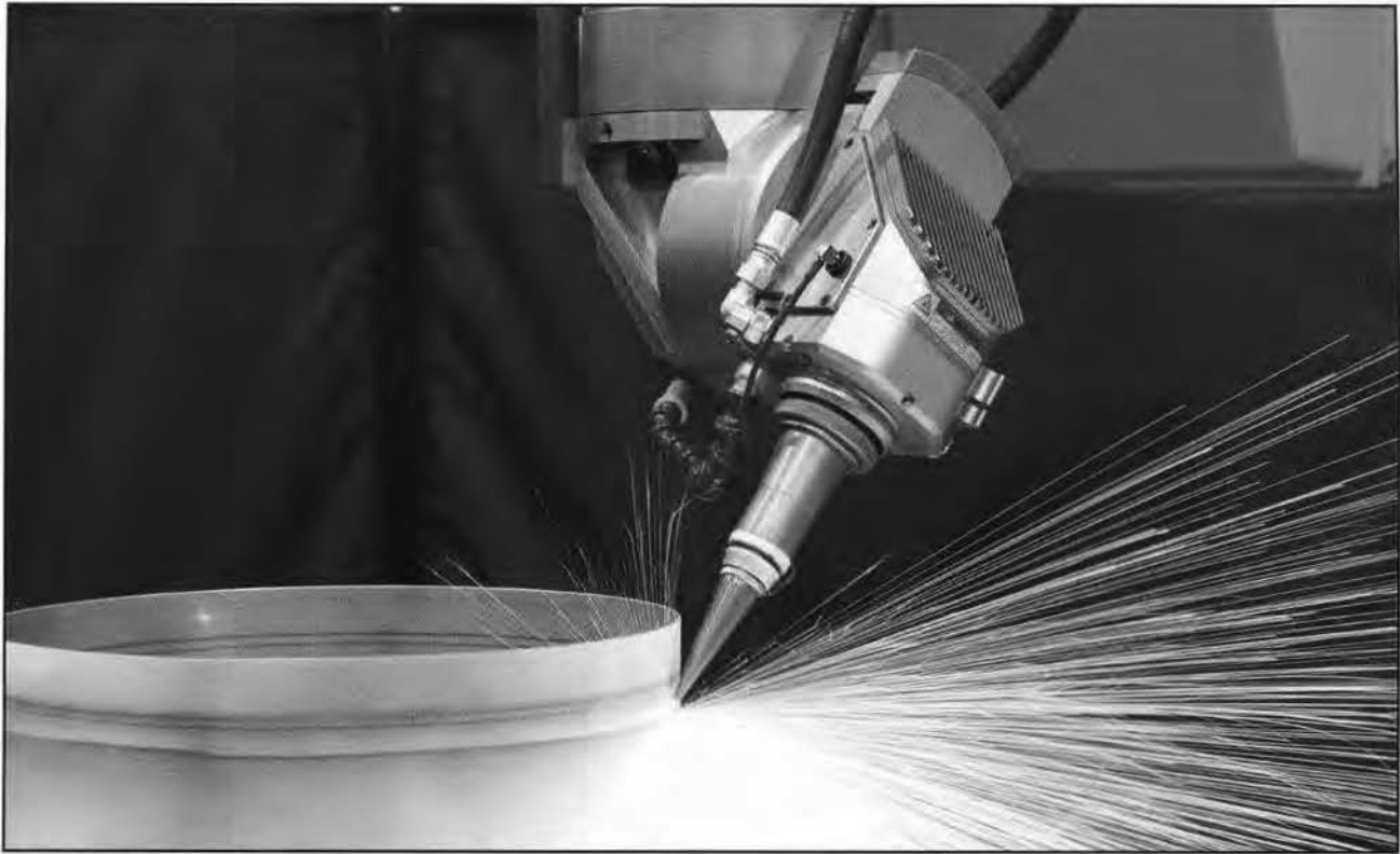
The addition of a Prima Power Laserdyne 795XL fiber laser system has expanded Hi-Tek's fabricating capabilities and accuracy.